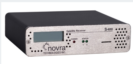
Small form factor with rackmount options